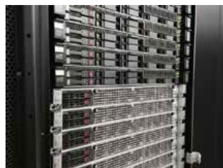
Figure 1: High Performance Computer System

In early human embryos, transcription is initiated at the 4-cell stage, which leads to the production of new proteins and cell differentiation. Recent studies have revealed that a transcription factor called DUX4 is expressed prior to zygotic genome activation and induces the expression of various genes and retrotransposons. We investigate the mechanism of activation of specific retrotransposons in early embryos by integrating single-cell transcriptome dataset with epigenetic datasets such as ATAC-Seq and ChIP-Seq data. We also aim to identify conserved and divergent elements of the retrotransposons among primates by comparing human, macaque, and marmoset embryos. Furthermore, we explore the transcriptional activity of the retrotransposons in a wide range of somatic cells, in which some of the retrotransposons might be adapted as regulatory elements.