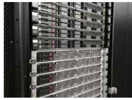
Figure 1: High Performance Computer System

In early human embryos, transcription is initiated at the 4-cell stage, which leads to the production of new proteins and cell differentiation. Recent studies have revealed that a transcription factor called DUX4 is expressed prior to zygotic genome activation and induces the expression of various genes and retrotransposons. We investigate the mechanism of activation of specific retrotransposons in early embryos by integrating single-cell transcriptome dataset with epigenetic datasets such as ATAC-Seq and ChIP-Seq data. We also aim to identify conserved and divergent elements of the retrotransposons among primates by comparing human, macaque, and marmoset embryos. Furthermore, we explore the transcriptional activity of the retrotransposons in a wide range of somatic cells, in which some of the retrotransposons might be adapted as regulatory elements.