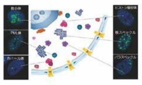
Figure 2: Schematic diagram of membraneless structures in mammalian cell nuclei